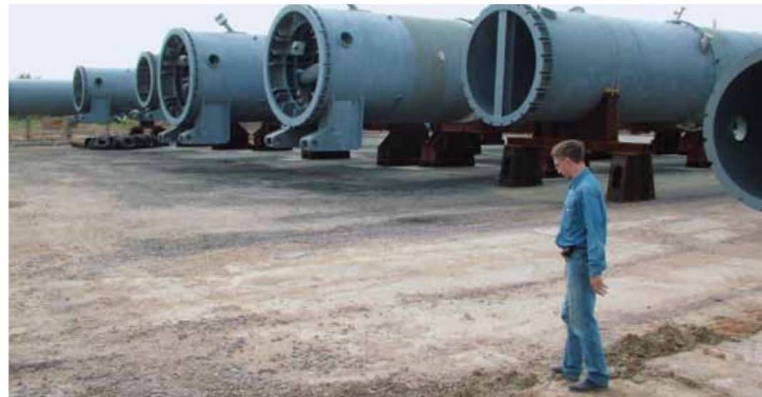
Large pipe sections stored on a platform stabilised with Tensar geogrids.

Gaining access to a drilling site, often in a remote location can be a challenging part of any oil or gas project. Roads and drilling pads are often constructed over poor soils and are frequently subjected to severe weather. Add to that the extremely heavy loads that they are expected to carry, then traditional solutions can be costly, time consuming and not environmentally friendly.