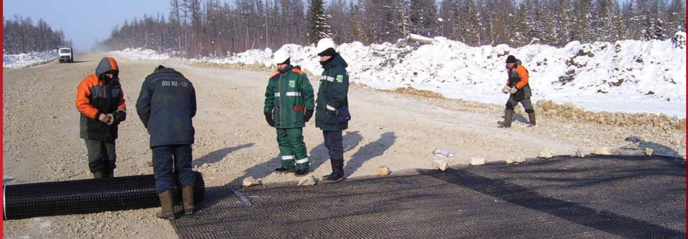
Tensar® geogrid being installed on a project in Eastern Siberia at a temperature of -40°C.

Tensar is a worldwide leader in the manufacture and provision of soil reinforcement and ground stabilisation products and systems. Our expertise and experience has been accumulated over several decades of successful collaboration in major international projects. Our service team, comprising many qualified civil engineers, provides practical and best value advice and design to support the use of Tensar products and systems in your application.