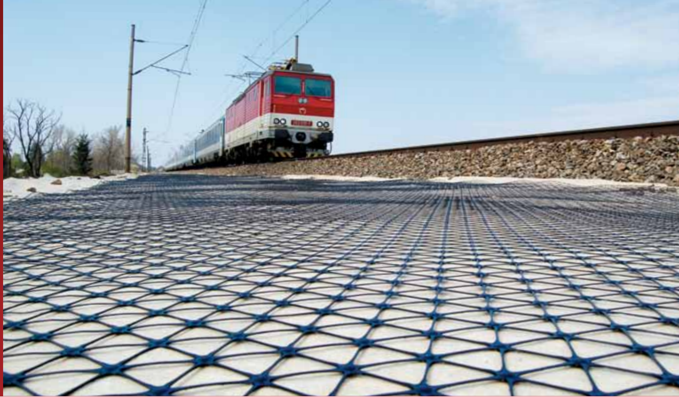
Tensar® geogrid used to stabilise track ballast since the early 1980s.