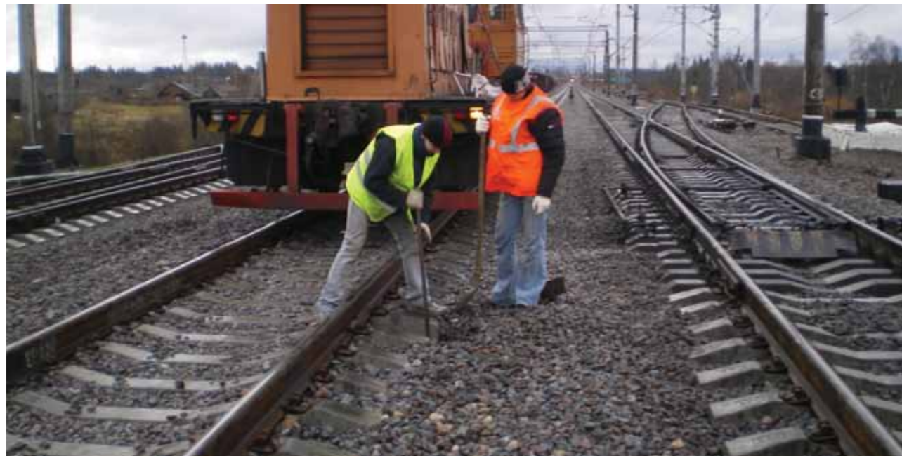
Cost effective solutions to suit your project requirements.

support the ballast effectively. This can involve a time consuming chemical stabilisation of the subgrade or deep excavation followed by importation and placement of a thick and expensive granular sub-ballast layer. Introducing Tensar geogrid stabilisation allows for a significant reduction of sub-ballast layer thickness for the same bearing capacity. This allows the reduction in subgrade excavation and spoil disposal and much less imported sub-ballast fill, while still achieving the target stiffness value required for the support of the ballast. Tensar has extensive experience in mechanically stabilising sub-ballast layers, especially in the upgrading of European railway corridors, that has resulted in many successful cost effective installations.