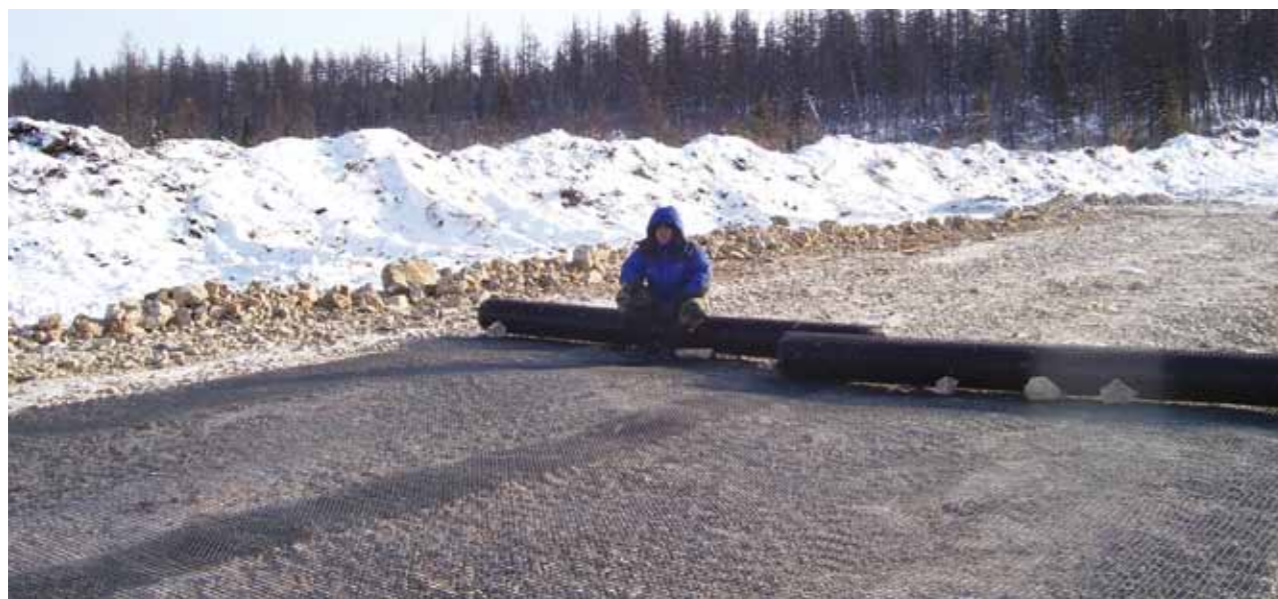
Tensar geogrids enable significant savings in granular thickness and consequent reduction in construction CO 2 emissions.