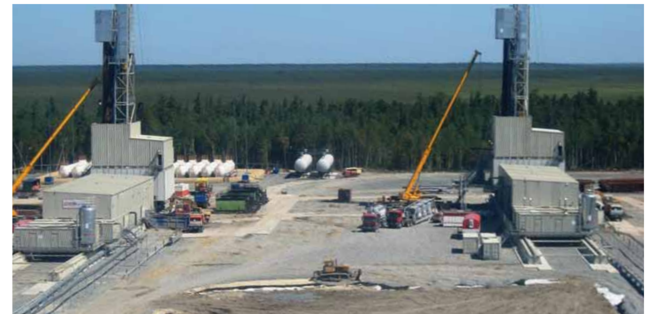
Tensar geogrid being installed at a drill pad in Western Siberia, Russia.