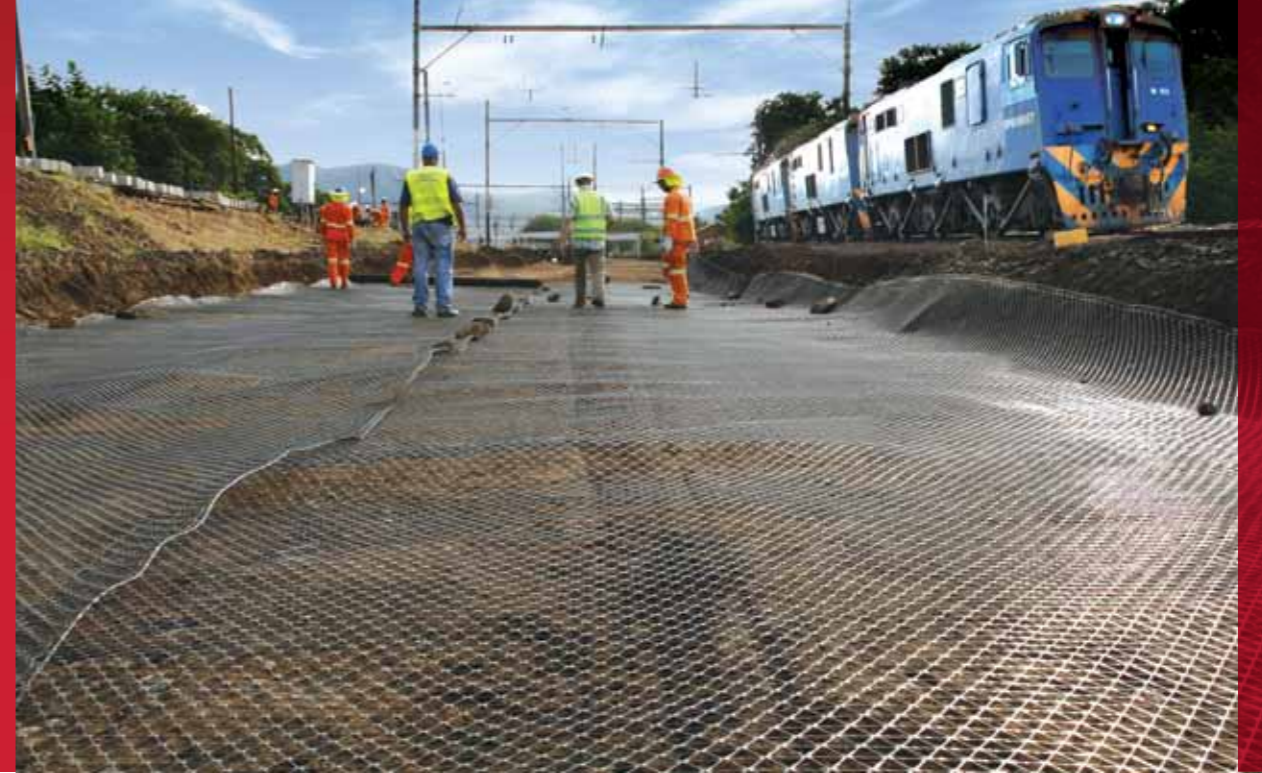
Mechanical stabilisation of sub-ballast can reduce construction costs.