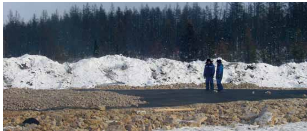
Tensar geogrids are installed in the building of this access road in the North Baikal region in temperatures of below -50°C.