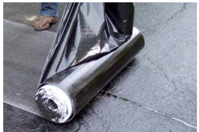
Glasstex® Patch™ 880 can be applied to most sound substrates utilising the adhesive coating.