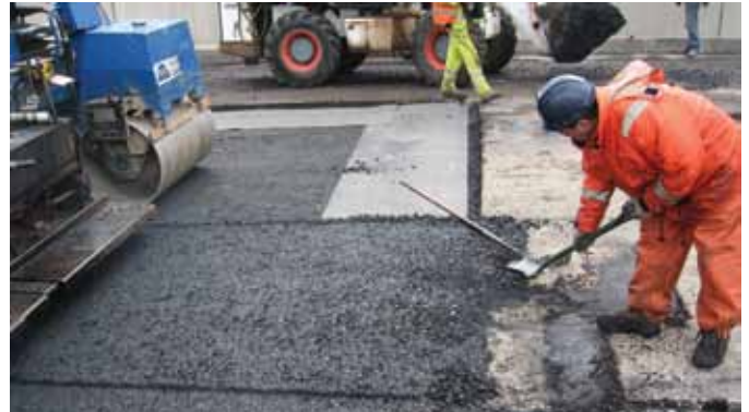
Glasstex®Patch™ 880 can be installed either between the base and binder course or the binder and surface course.

The Challenge: Albert Royds Road is a busy, local highway close to the M62 motorway serving both commercial and residential areas of Rochdale, plus the towns and villages beyond. With the need to keep disruption to this important local route to a minimum, contractor Balfour Beatty Civil Engineering were called in to provide a solution to a potential reflective cracking problem and the effects of differential settlement between a rigid concrete bridge deck and a flexible pavement construction.