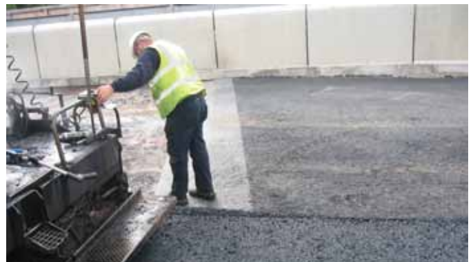
Glasstex®Patch™ 880 can be overlaid by either hand or machine lay operations.

The Solution: Craig Roberts, Tensar Area Civil Engineer, proposed the use of Tensar Glasstex®Patch™ 880 to inhibit the development of reflective cracking. Pieces of Glasstex®Patch™ 880 were cut to length and rolled out over the problem joints. A thick asphalt overlay of between 100mm and 130mm was placed on top.